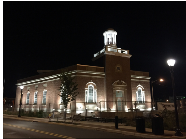
NEW BOROUGH COMPLEX at night.

Also in the offing for the day are the annual art show in Memorial Park, model train displays at the Fairmount Firehouse, a health fair, family fun area, firefighters' water battle and much more. And don't forget the annual fireworks extravaganza which will conclude the day when they launch from Memorial Park shortly after sunset.